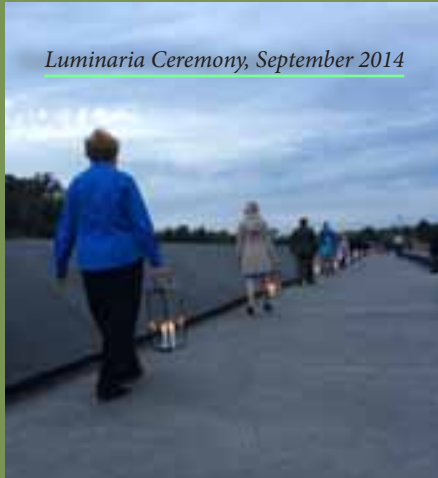
Luminaria Ceremony, September 2014