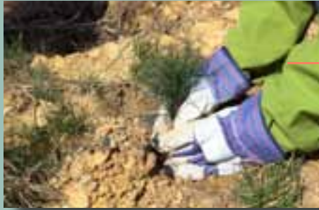
Reforestation, April 2014