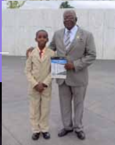
A grant from the Pittsburgh Penguins Foundation will help the Friends support education initiatives.

More than 600 youth have used the park's new Junior Ranger Handbook, including this Flight 93 family member who visited with his grandfather in 2014.