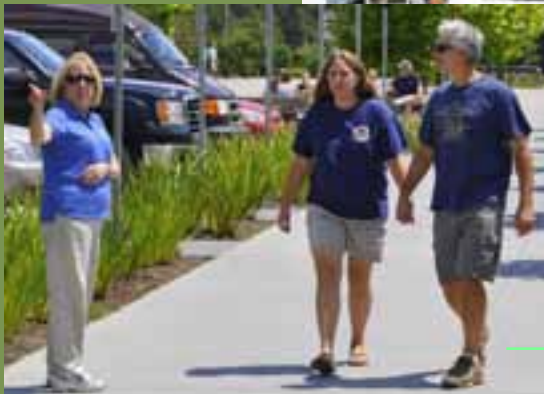
Friends Plaza Greeters help visitors