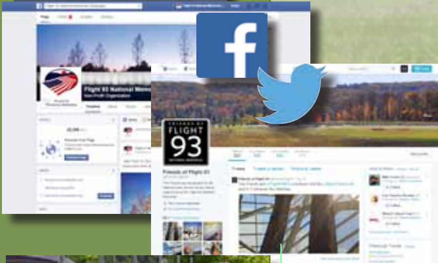
Join the Friends on Social Media: Flight 93 National Memorial Campaign @FriendsFlight93