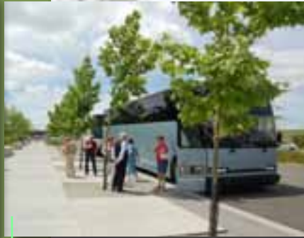
More than 800 groups visited Flight 93 National Memorial in the past year