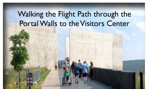
Walking the Flight Path through the Portal Walls to the Visitors Center