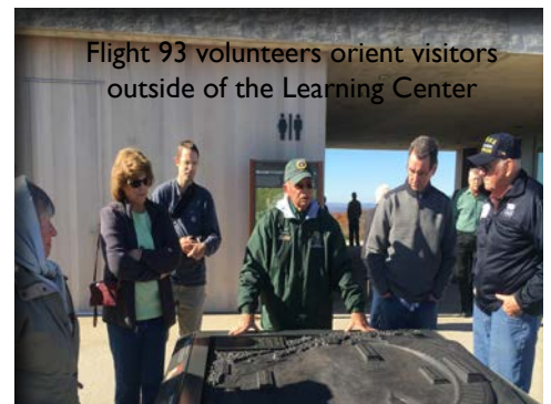
Flight 93 volunteers orient visitors outside of the Learning Center