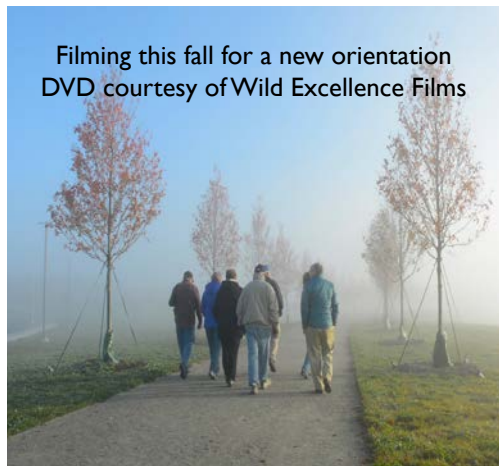
Filming this fall for a new orientation DVD courtesy of Wild Excellence Films