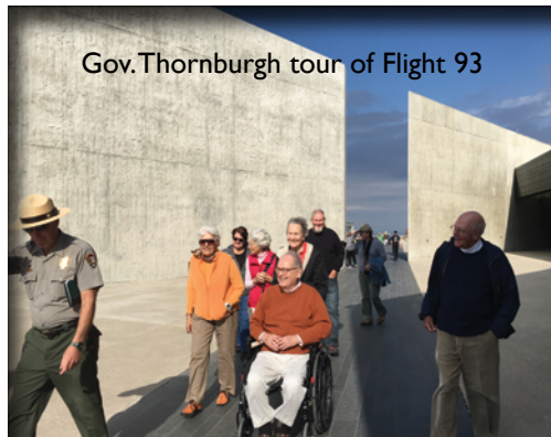
Gov. Thornburgh tour of Flight 93