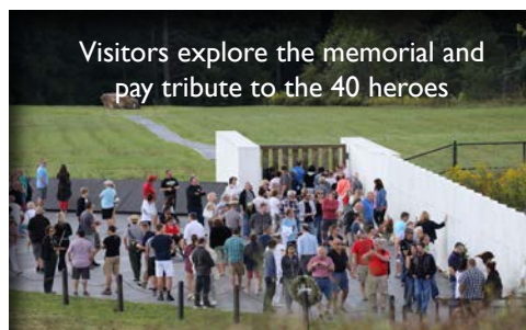
Visitors explore the memorial and pay tribute to the 40 heroes