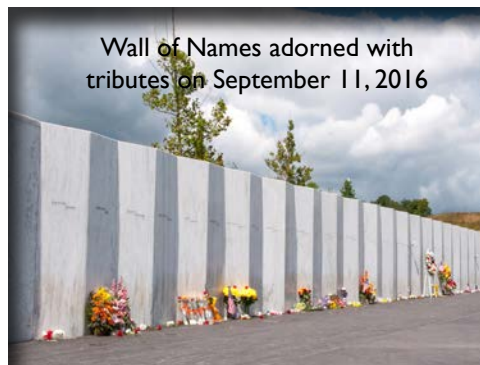
Wall of Names adorned with tributes on September 11, 2016