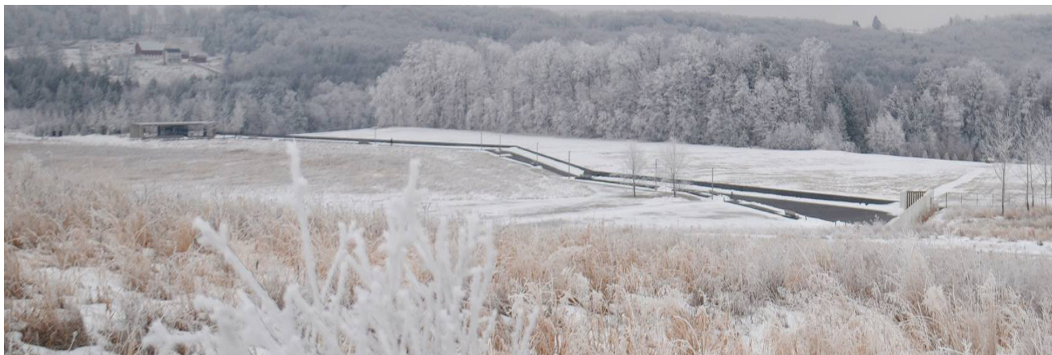
Memorial Plaza in Snow