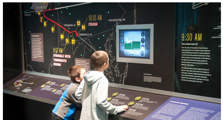
Children Explore the Visitor Center Exhibits / Chuck Wagner