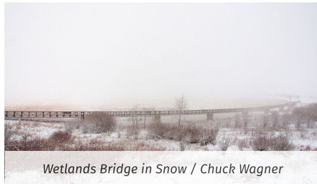
Wetlands Bridge in Snow / Chuck Wagner