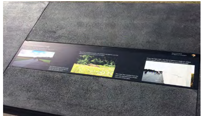
Niche signage was installed this spring along the Plaza walkway to the Wall of Names.