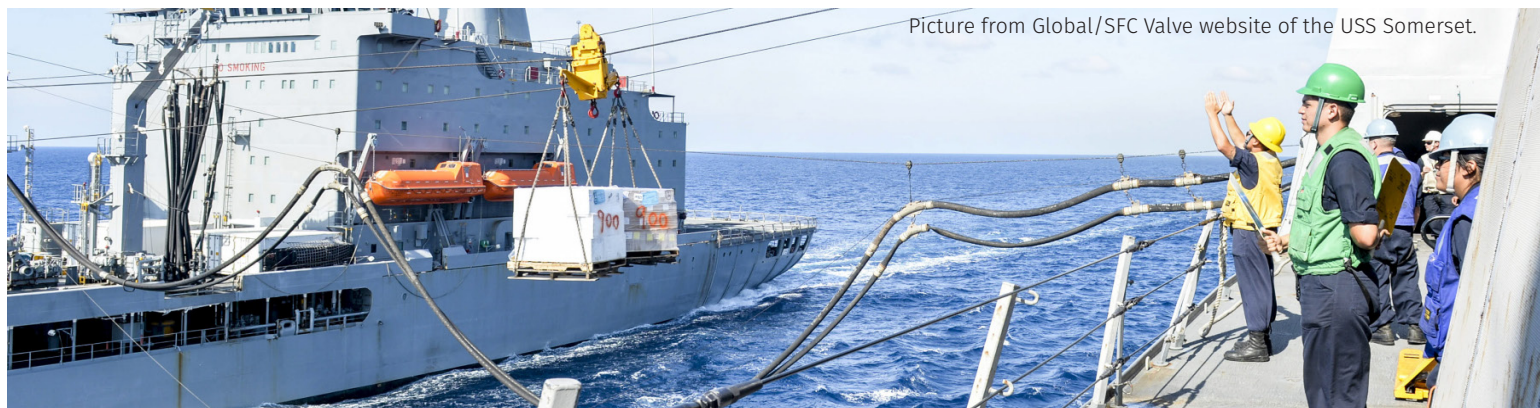
of the USS Somerset.

Thank you to all who contributed in making this holiday drive a success!