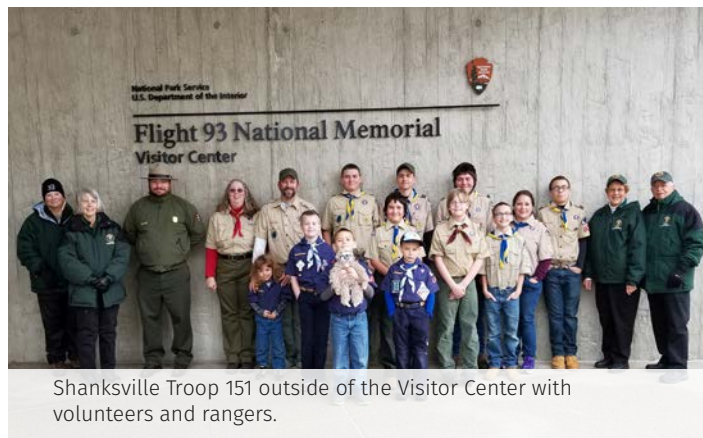
Shanksville Troop 151 outside of the Visitor Center with volunteers and rangers.