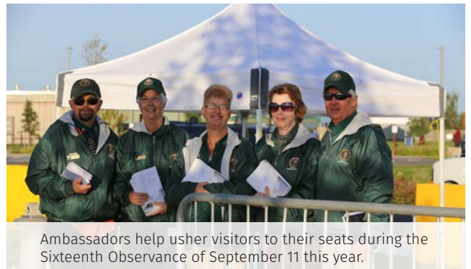
Ambassadors help usher visitors to their seats during the Sixteenth Observance of September 11 this year.