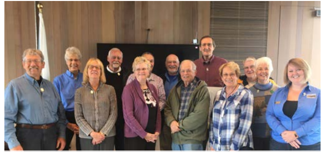
Friends members pose with their 5-year pins at the annual membership meeting.