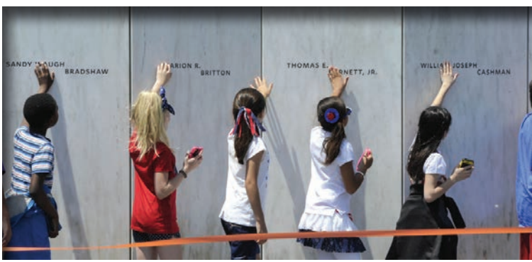
Baldwin-Whitehall 4th Grade Students visit the Memorial

» Over four days in May, the Baldwin-Whitehall School District in Allegheny County visited Flight 93 National Memorial to participate in a pilot program geared towards educating the next generation about Flight 93. The pilot program was generously supported by UPMC Health Plan. » The countdown to the National Park Service's 100th Anniversary on August 25th is officially in full swing! The NPS has been featured nationwide across shows like Good Morning America and the cover of National Geographic magazine. Flight 93 National Memorial and the other 4