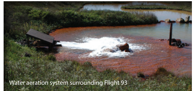
Water aeration system surrounding Flight 93