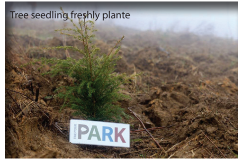
Tree seedling freshly planted