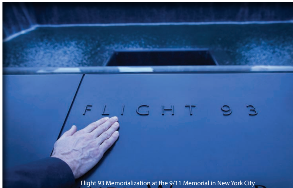
Flight 93 Memorialization at the 9/11 Memorial in New York City

The Friends' received a $10,000 grant on behalf of the Community Initiatives Fund of the Community Foundation for the Alleghenies in early November. The grant will support the Map, Diagram and Sign Replacement Project. The project is aimed at refurbishment and replacement of damaged signage and property that was a result of last year's HQ fire that damaged artifacts and essential signage at Flight 93 National Memorial.