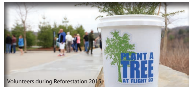
Volunteers during Reforestation 2015