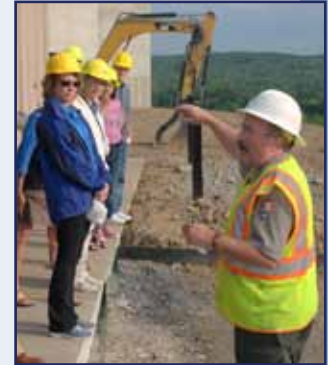
Walk 93, an inaugural event organized by the Friends of Flight 93 and Leadership Somerset County, raised more than $23,000 for the building and maintenance of trails at the park.