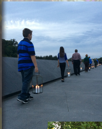
Luminaria Ceremony September 10, 2014