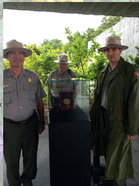
Right: Park Rangers flank the Congressional Gold Medal on public display at Memorial Plaza