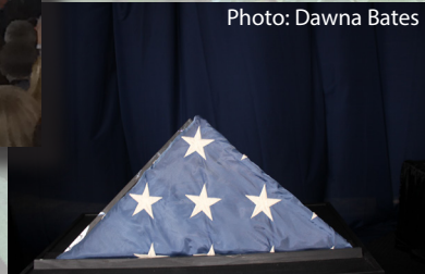
U.S. Flag that was flown over the Capitol on 9-11-01